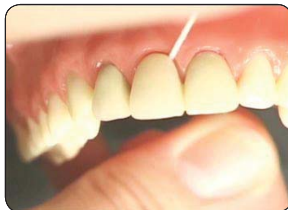
Superflossing a bridge